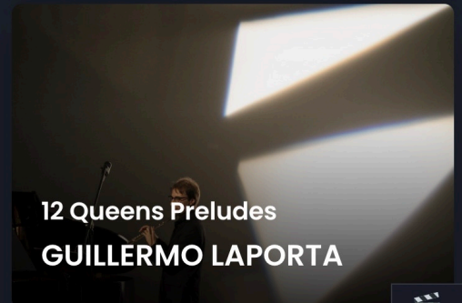
12 Queens Preludes GUILLERMO LAPORTA